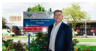
Memorial Hospital update