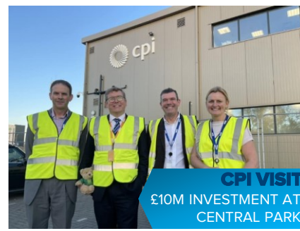
CPI VISIT £10M INVESTMENT AT CENTRAL PARK