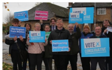
Local Council Elections 2023