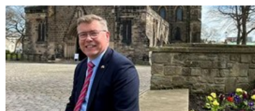
My message and update