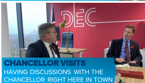
CHANCELLOR VISITS HAVING DISCUSSIONS WITH THE CHANCELLOR RIGHT HERE IN TOWN