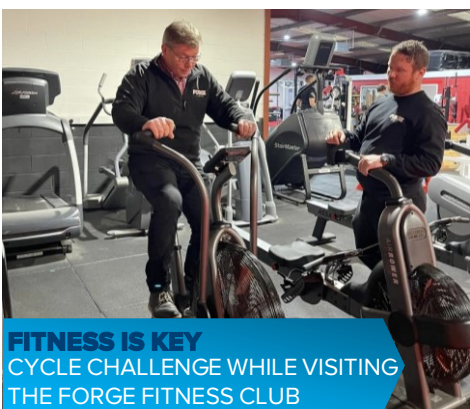
FITNESS IS KEY CYCLE CHALLENGE WHILE VISITING THE FORGE FITNESS CLUB