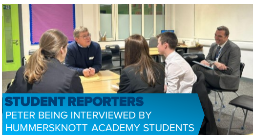
STUDENT REPORTERS PETER BEING INTERVIEWED BY HUMMERKNOTT ACADEMY STUDENTS